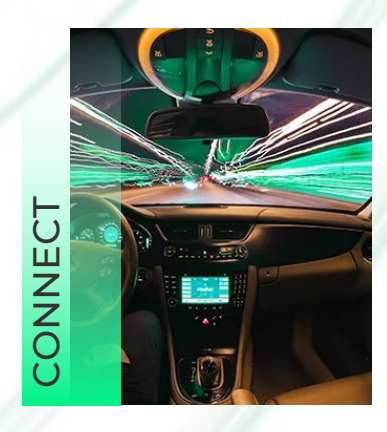
Connect about successes, failures, case studies, new ideas and current trends