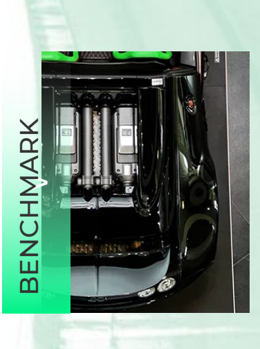
Benchmark proven practices, insights, lessons learned, and practical suggestions through material in threaded forum discussions, conversations, and interactions

More connections. More collaboration. More benchmarking.