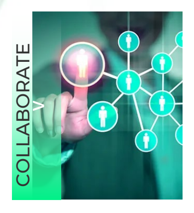
Collaborate through brainstorming, asking and answering questions, building on each other's ideas, and staying informed on emerging developments